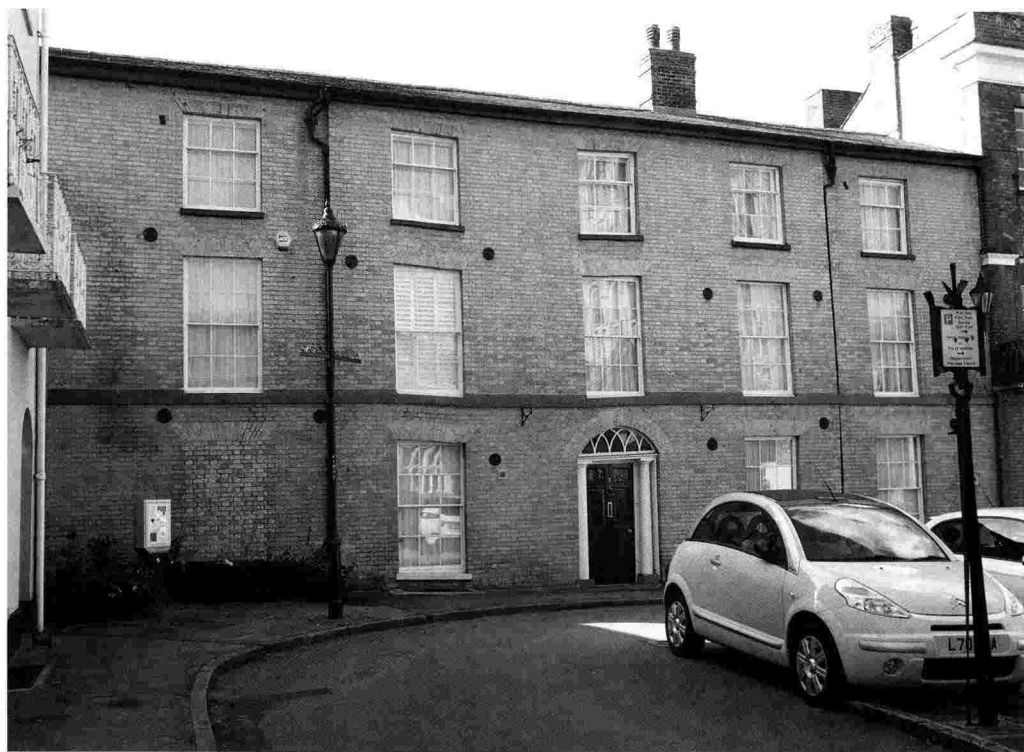
FIG. 138 – No. 3 Chequer Square, Bury St Edmunds.