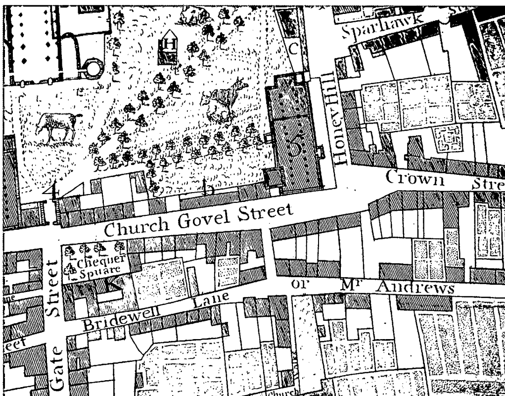
FIG. 137 – Thomas Warren's map of Bury St Edmunds, 1776. The Woods' school, now 3 Chequer Square, is the building marked K.

The Woods announced in February 1729 that they had moved to a 'Large, Commodious House in the Chequer Square', which suggests that the number of pupils at their school may have been increasing. 23 The advertisement gives details of the boarding school for the first